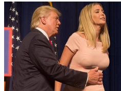
22 Photos Donald Trump Doesn't Want You To See!