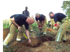
Firefighters Heard Cries From Underground. What They Found Was Extraordinary

Posted in Military on Friday, July 21, 2017 1:00 am.