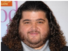
It's Almost Hard To Fathom What He look's Like Now